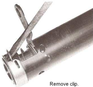
Remove clip. Lower lever on 1969-76 columns only.

Pry the lower bearing wire clip from the column jacket with a screwdriver. Remove the stamped lower bearing shield (retainer). Pull the lower bearing and plastic lower bearing adapter from the column mast jacket.